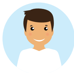
Advance Care Planning Facilitator