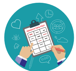
Advance care planning