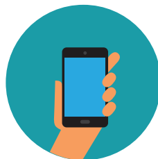
Access to helpline