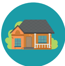
At home self-management education