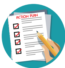
Creation of a patient action plan