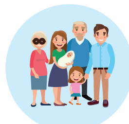
Family/ Primary Care Giver