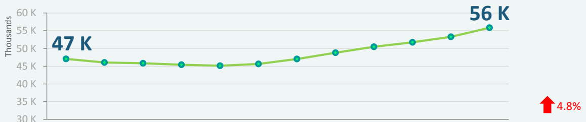
Number of people on the Need a Family Practice Registry Mar 2020 – Feb 2021