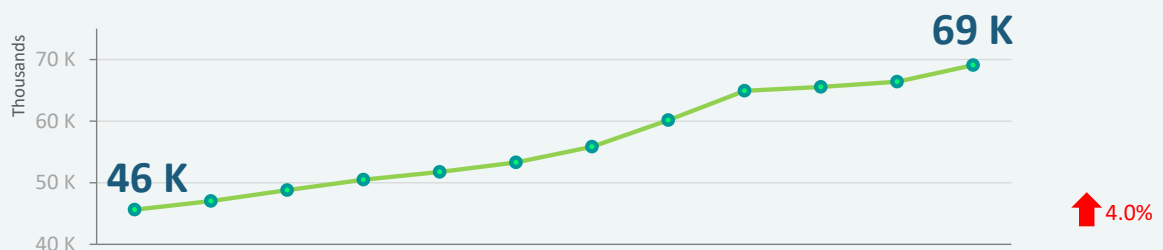
Number of people on the Need a Family Practice Registry Aug 2020 – Jul 2021