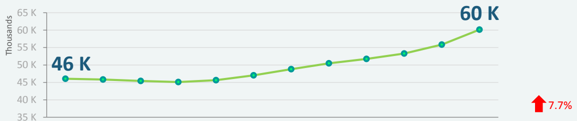
Number of people on the Need a Family Practice Registry Apr 2020 – Mar 2021