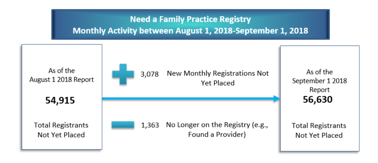
Figure 1: Need a Family Practice Registry - Monthly Activity

During the month of August, 3,078 new registrations occurred. 1,363 registrants were removed from the registry. Figure 1 highlights the overall activity in the registry during the month of August 2018.