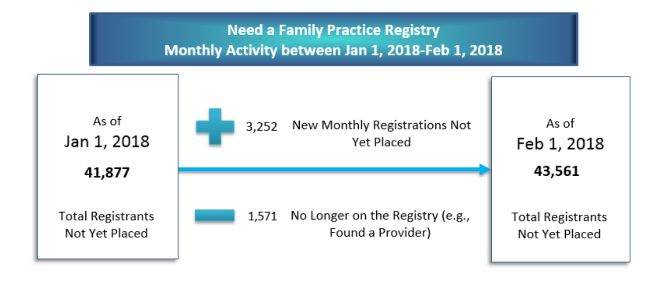
Figure 1: Need a Family Practice Registry - Monthly Activity

During the month of January, 3,252 new registrations occurred. 1,571 registrants were removed from the registry. Figure 1 highlights the overall activity in the registry during the month of January 2018.