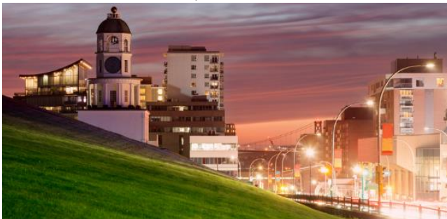
Halifax, Central Zone

In Nova Scotia, you're never more than 30 minutes from the ocean. With approximately 7500 kilometers of coastline, beaches, coastal trails, and incredible paddling are all right outside your door and waiting to be explored.