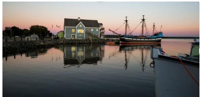
Pictou, Northern Zone

Just under one million people enjoy what Nova Scotia has to offer. From historical sites, wineries, award winning restaurants and a thriving arts and culture scene, Nova Scotia really does have it all.