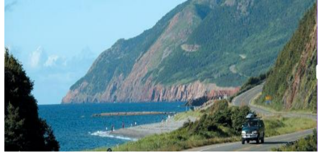
Cabot Trail, Eastern Zone

Nova Scotia offers four seasons of outdoor adventure. Kayak or hike along our coastline, snowshoe our trails, or dust off that bike and explore the trailways that connect our province. There is no shortage of outdoor fun!