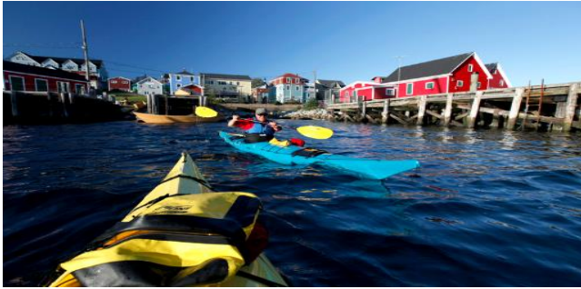
Lunenburg, Western Zone